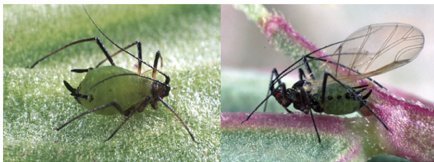
Figure 1. Inducible wing polyphenism in the vetch aphid Megoura viciae (A) wingless form produced in favourable conditions (e.g. low density). (B) winged form produced in deteriorating conditions (e.g. crowding).

The developmental program underlying the determination of alternative phenotypes in aphids is far from well understood, but this biological system attracts increasing attention from evo-devo researchers. Comparative analysis of sexual and asexual development in the pea aphid has been